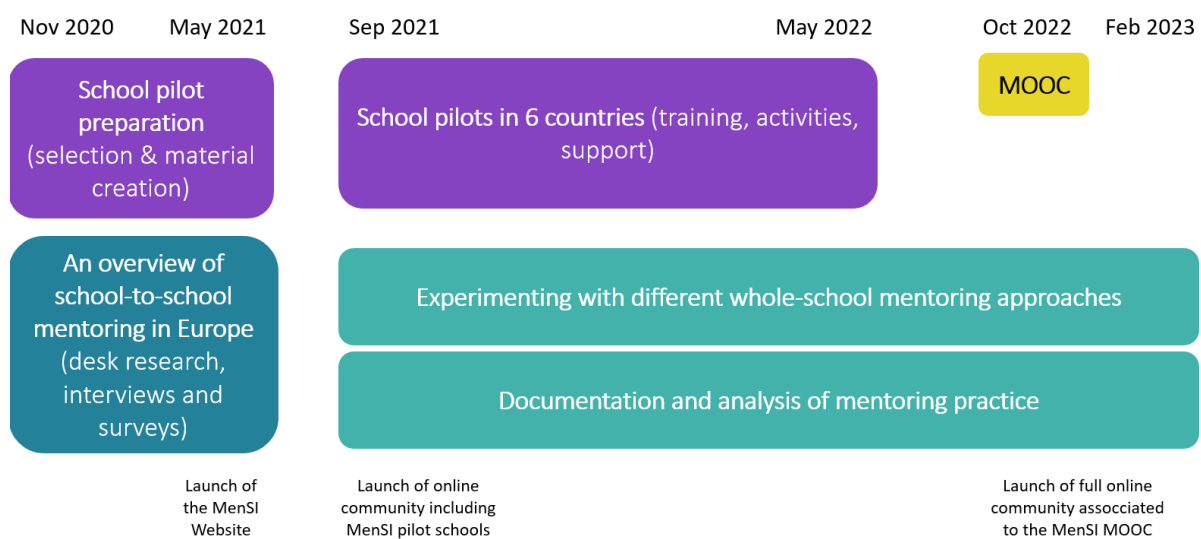
Figure 5: MenSI platform timeline

Figure 5 presents a summary of the major steps of the platform development in the context the project overall.